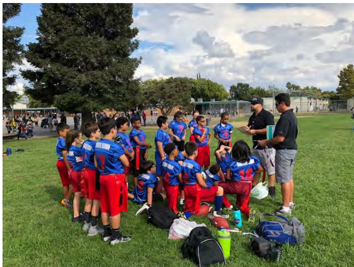
Didion's undefeated flag football team at the first game of the season versus Matsuyama

Girls: white top, dark bottom. Boys: white shirt/tie, dark bottom.