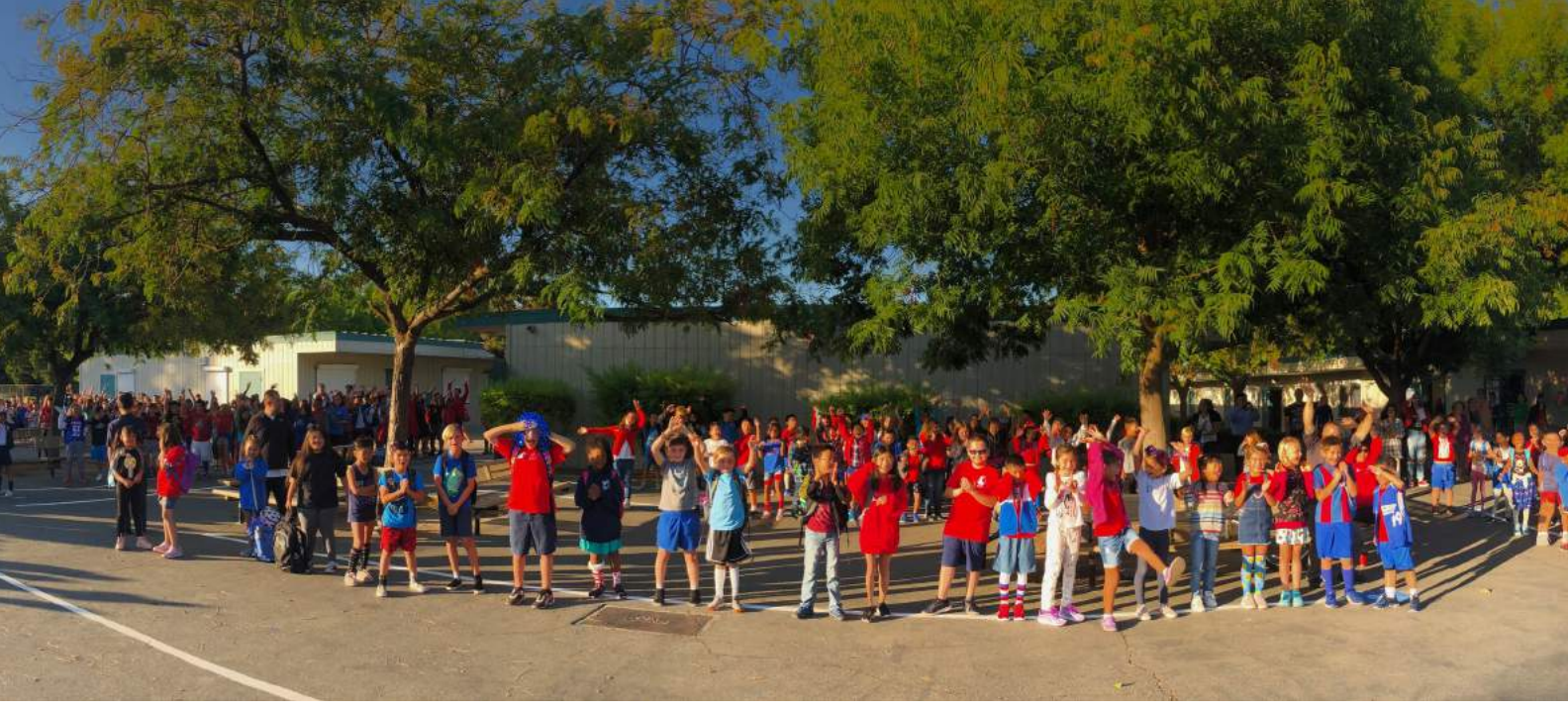
Didion Dragons on the first Spirit Day of the year